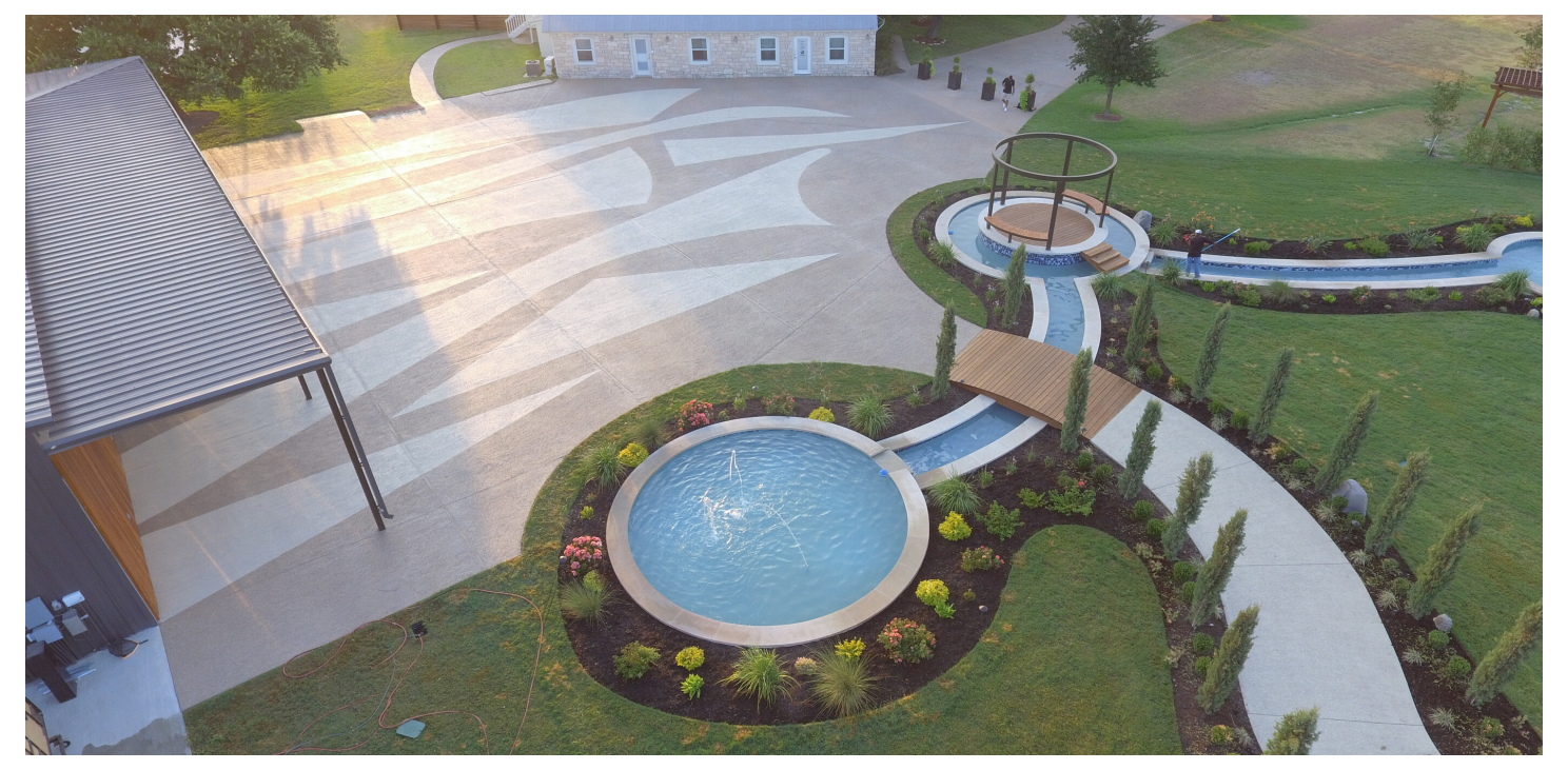
Photograph and installation by Sundek of Austin