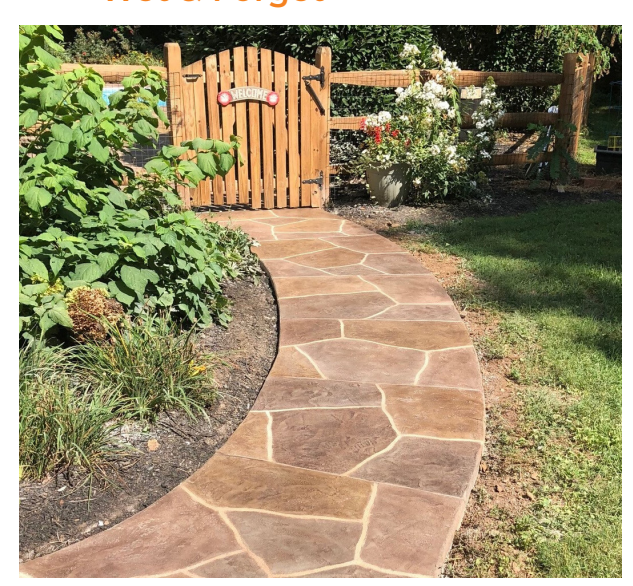
Photograph and installation by Sundek of Washington

Recommended Products: Nature's Orange, SunTough, Trisodium Phosphate (TSP) or Wet & Forget