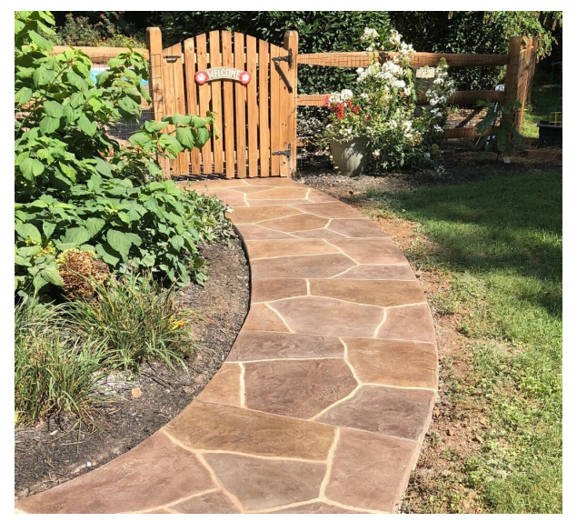
Photograph and installation by Sundek of Washington

Recommended Products: Nature's Orange, SunTough, Trisodium Phosphate (TSP) or Wet & Forget