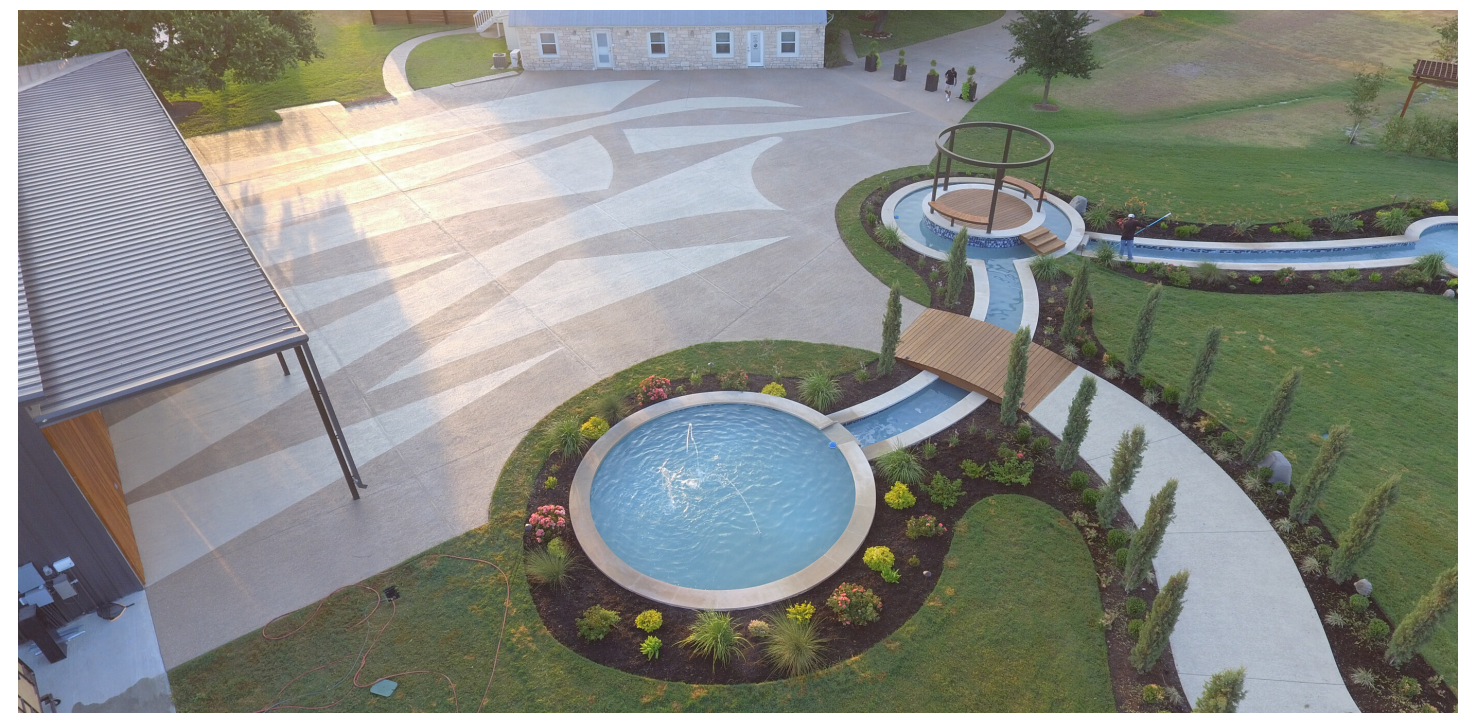
Photograph and installation by Sundek of Austin