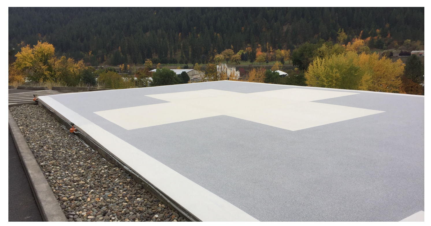
Photograph and installation by Knox Concrete

High Performance flooring systems (i.e. Epoxy, Polyurethane, Polyaspartic, Quartz, etc.) are used in many environments requiring surface textures varying from aggressive skid/slip resistance to moderate skid/slip resistance to smooth, non-textured finishes. A smooth floor coating finish will be slippery when wet, but it is very easy to keep clean using normal floor maintenance methods: sweeping, buffing, mopping, etc. A moderate or aggressive textured floor coating finish offers safety against slip/fall accidents but may require a modification to existing cleaning procedures, depending on what type of soil and/or contaminants are involved. Self-contained mechanical scrubbers are the most efficient and cost effective commercial cleaning method for these areas. Spray cleaning with hose is effective in areas that have drains. Agitation and scrubbing with a deck brush or stiff-bristled push broom works well in small areas.