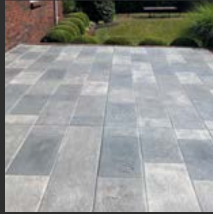
Hand Taped Designs