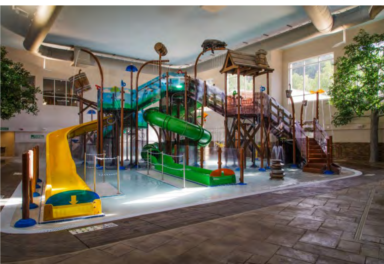
Great Wolf Water Park, Gatlinburg, Tennessee. SunStamp System Contractor: ATD Concrete Coatings

A splash pad project of any scale requires expertise and thoughtfulness to ensure success. The following tips and guidelines provided by Unruh, Soderberg, and Tony Hernandez of ATD Concrete Coatings can be used in developing the scope of your splash pad project. Once you're ready to begin, be sure to contact SUNDEK to resurface your splash pad or to be connected with splash pad expert for more specific advice.