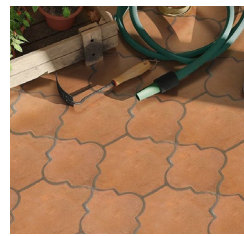
Terracotta floor tiles