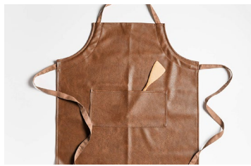
Leather (and faux leather)