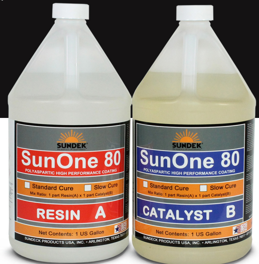
Available in 100% solids