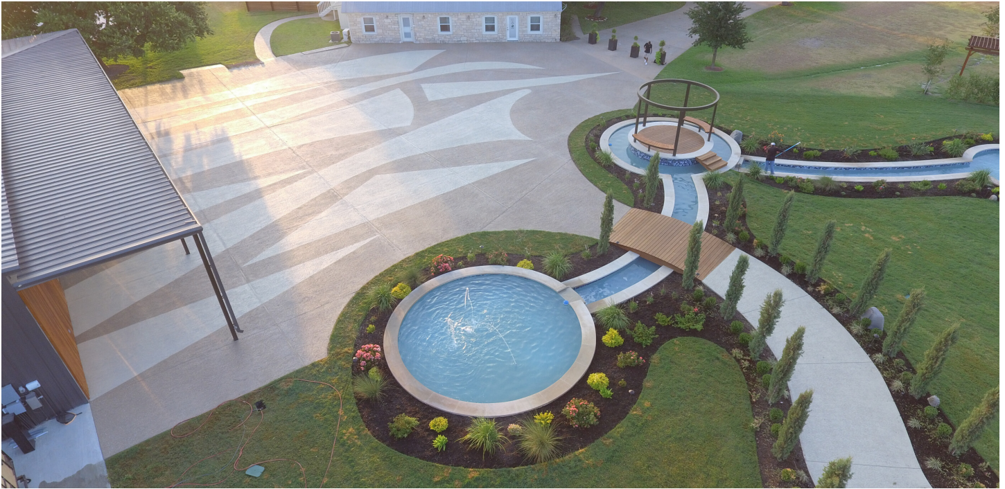
Photograph and installation by Sundek of Austin

Don't like maintenance, let SUNDEK handle for you!