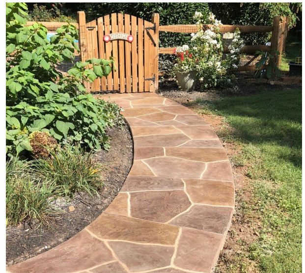
Photograph and installation by Sundek of Washington

Use non-calcium chloride Eco-friendly products that are Magnesium Chloride, Carbonyl Diamide or Glycol Based. Additionally, a lithium based deicer will not damage finished surfaces. "Salt products", although inexpensive to use, cause damage to concrete. Any chemicals that are used, regardless of the composition, should be rinsed off within a week.