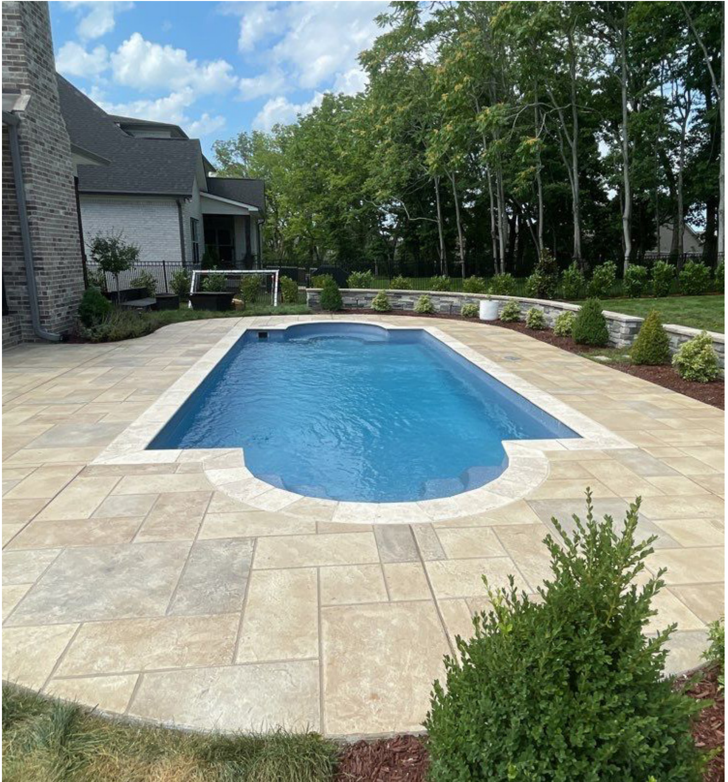
Photograph and installation by Sundek of Nashville